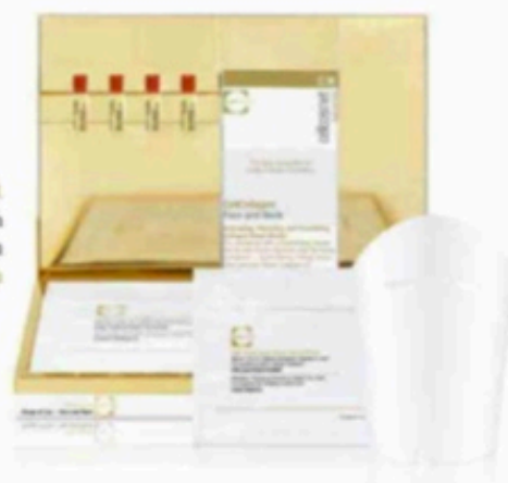
CellCosmet CellEctive CellCollagen Visage et Cou www.cellip.com