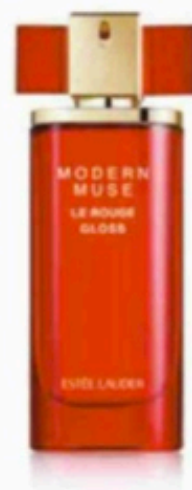
ESTÉE LAUDER Modern Muse Le Rouge Gloss www.esteelauder.ch