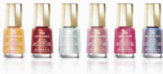
MAVALA Disco Color's www.trend-on-line.com