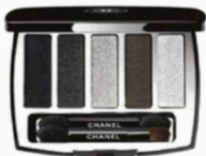
CHANEL La Collection Libre de CHANEL 2016 www.chanel.com