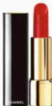
CHANEL La Collection Libre de CHANEL 2016 www.chanel.com